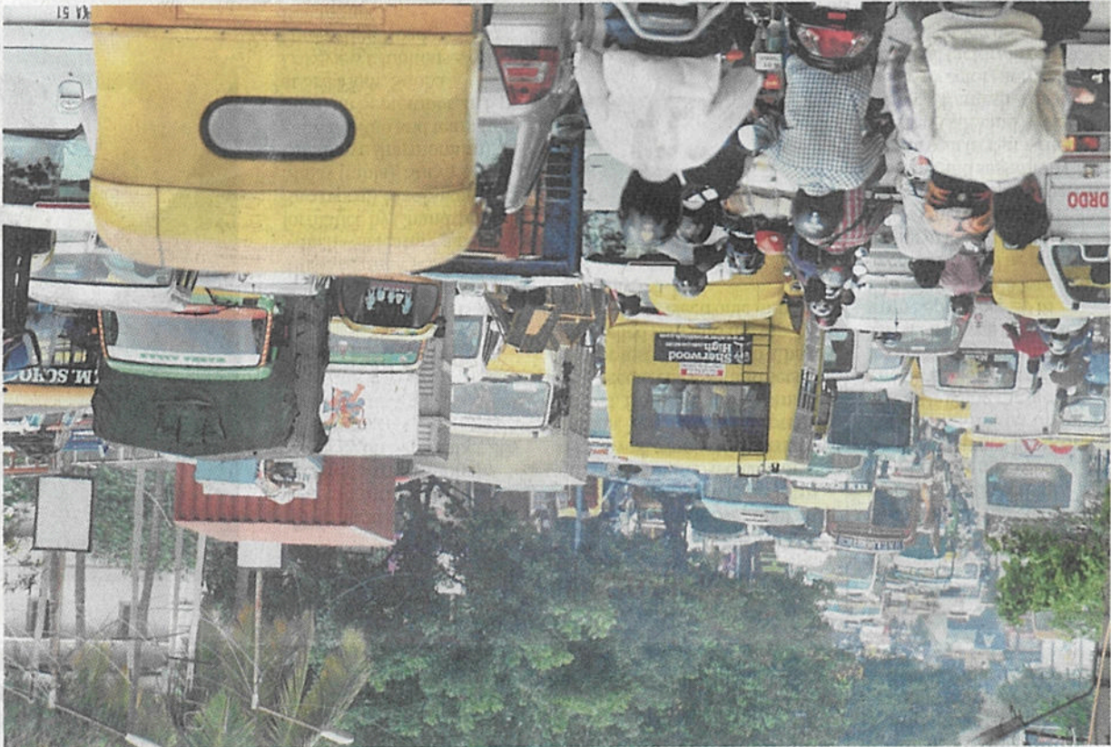
NIGHTMARE There's bumper-to-bumper traffic all the time on Bannerghatta Road.